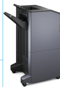
DF-7130 4 4,000 Sheet Finisher 100 Staple / 100 Manual Staple