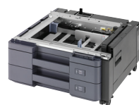
PF-7100 2 x 500 Sheet Tray (Ledger)