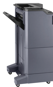
DF-7110 4,000 Sheet Finisher 65 Staple / 65 Manual Staple