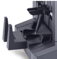
BF-730 Booklet / Tri-fold Unit