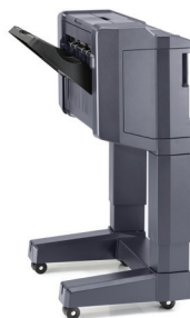
DF-7120 1,000 Sheet Finisher 50 Staple