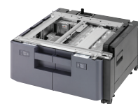
PF-7110 2 x 1,500 Sheet Tray (Letter)