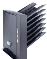
MT-730 (B) 7 Bin Mailbox