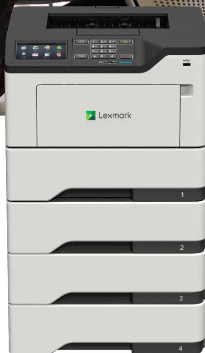
M3250 with optional trays